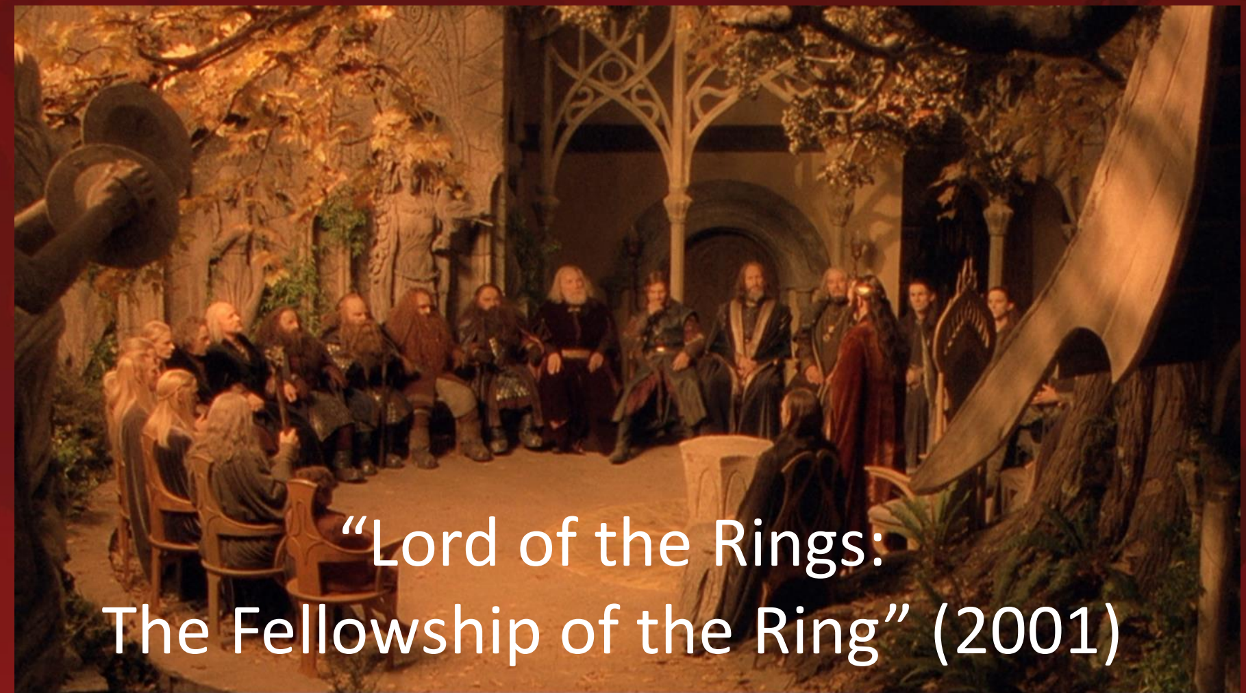
"Lord of the Rings: The Fellowship of the Ring" (2001)