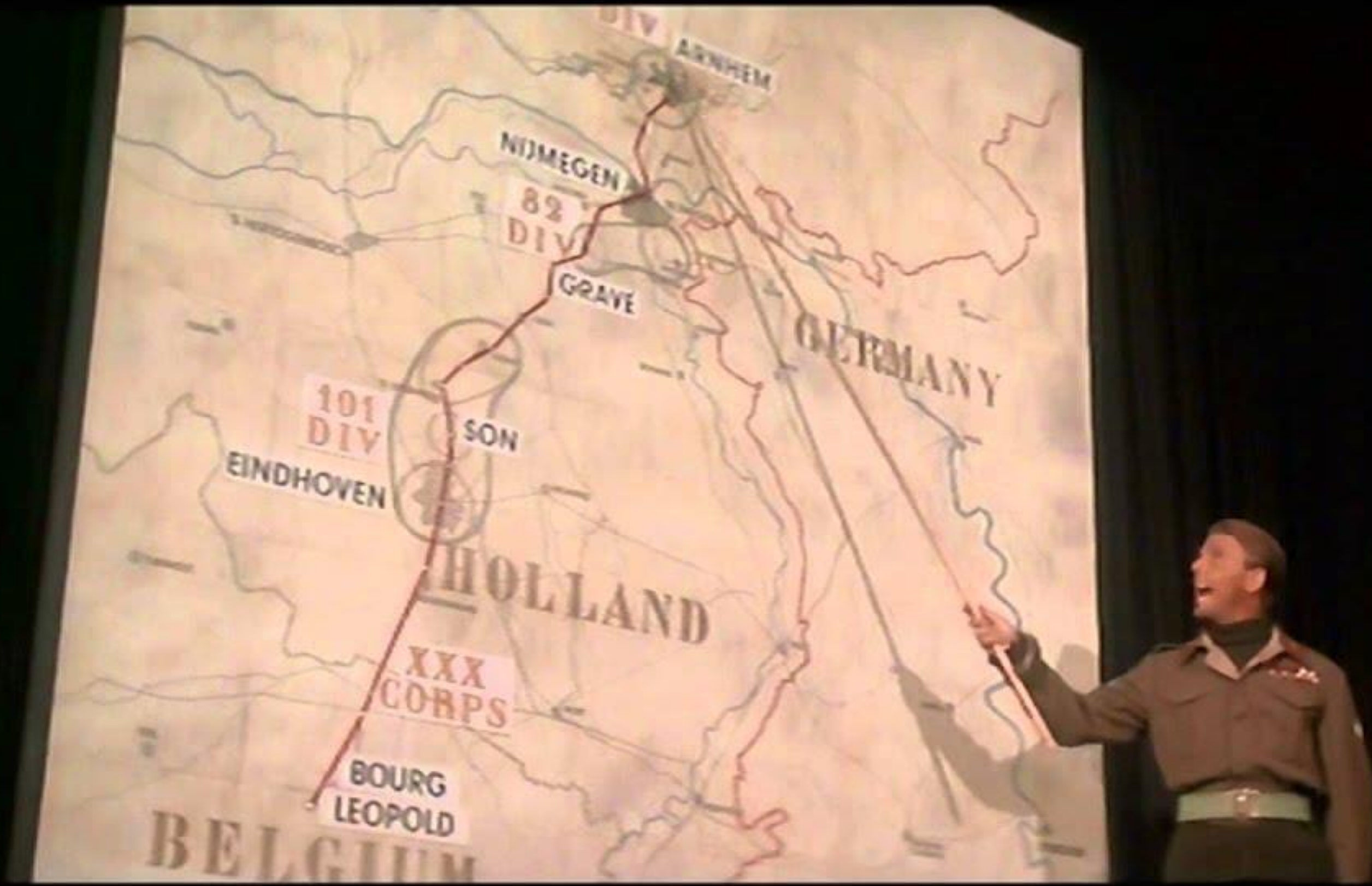
A Bridge Too Far (1977)