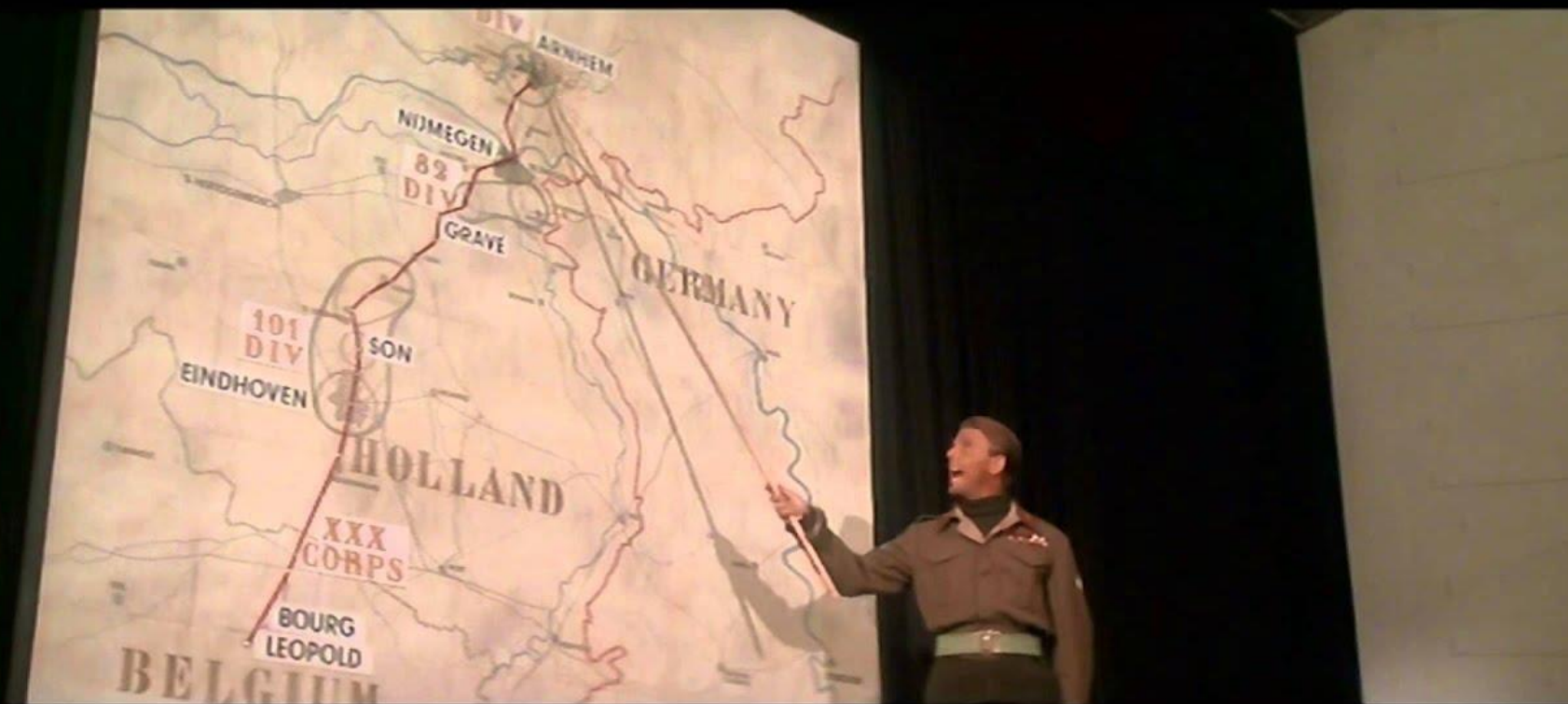
"A Bridge Too Far" (1977)