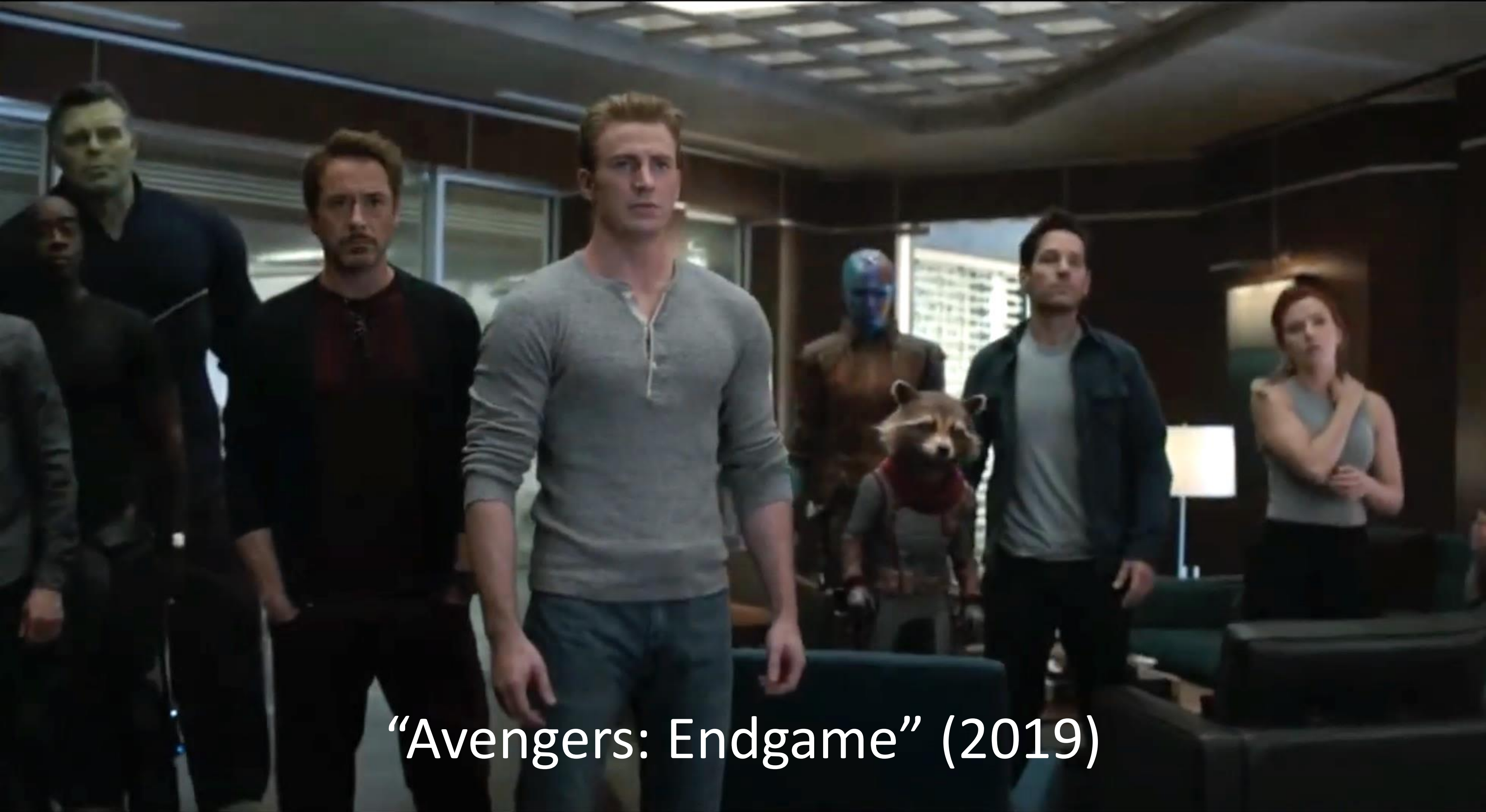
“Avengers: Endgame” (2019)