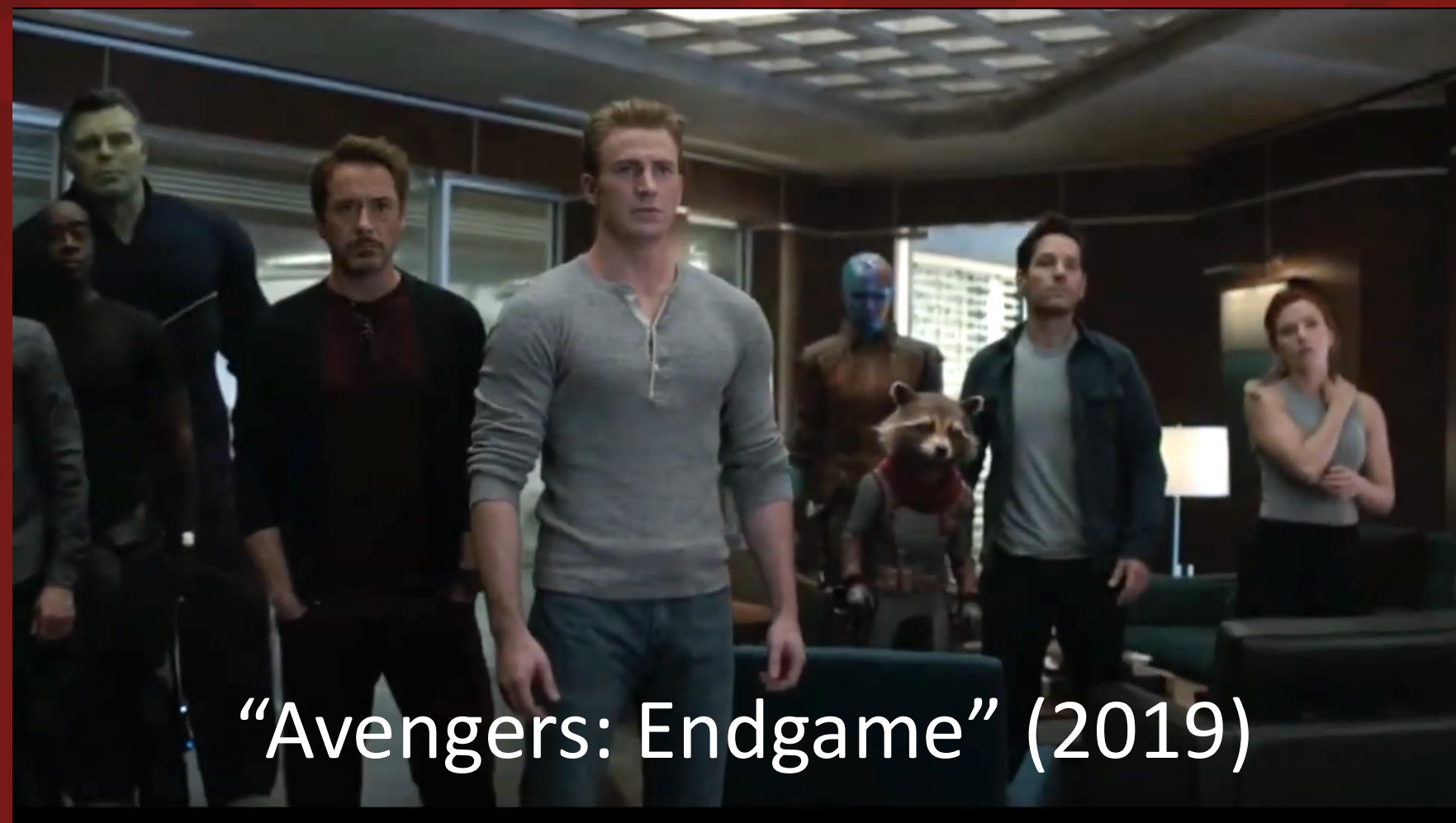
"Avengers: Endgame" (2019)