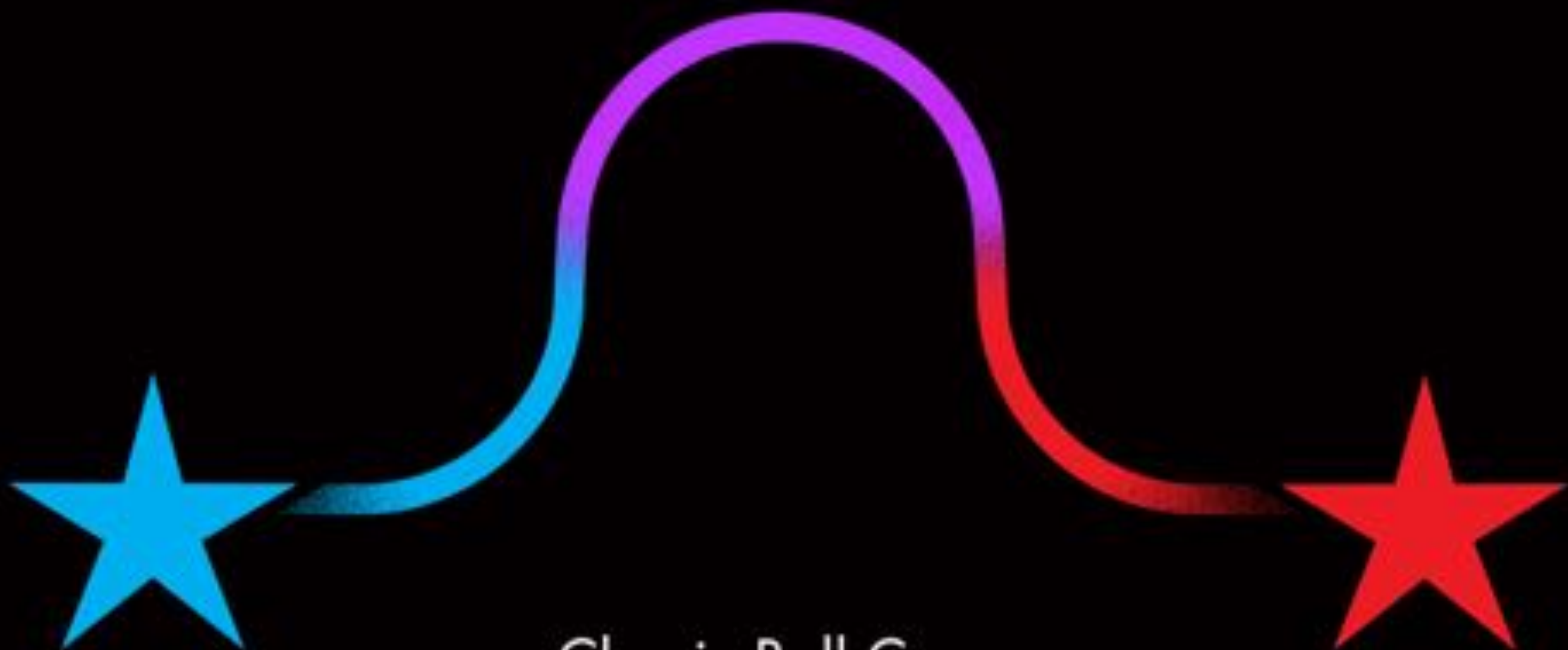
Classic Bell Curve