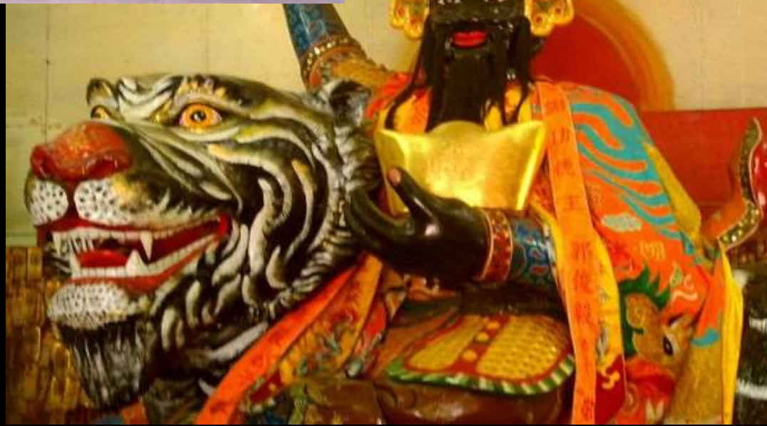
武財神 god of wealth (general)