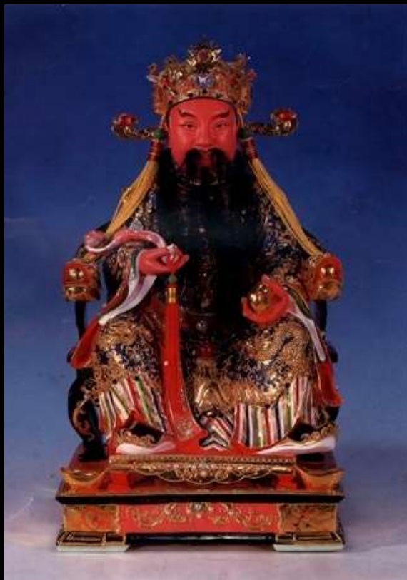
文財神 god of wealth (governor)